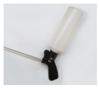
Sleek, lightweight Delrin and durable stainless steel design.

With the Evolution Injector<sup>TM</sup>, embalming has never been easier. Simply remove the cavity injector with the click of a button and screw it onto your solution bottle. Attach the bottle to the Evolution Injector and you're ready to go!