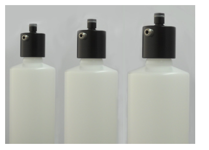
Prepare multiple bottles of fluid for use at one time.