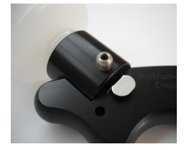
Quick Release bottle attachment for easy bottle installation and removal.

A combination of our chemical cavity injector and Comfort Grip Trocar<sup>™</sup> into one new product, bringing you the Evolution Injector<sup>™</sup>. Designed to bring the process down to one hand for advanced maneuverability.